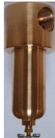
B370 - 1"