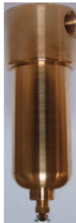
B365 - 1/2"