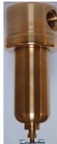
B146 - 3/4"