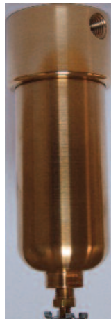
B360 - 1/4"